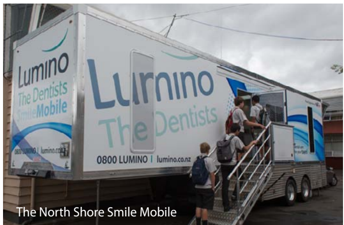
The North Shore Smile Mobile

Lumino The Dentists also offers a wide range of preventative, restorative and cosmetic private dental treatments for adults and children. Treatments include whitening, porcelain veneers, crowns, bridges and fillings. Visit our website at lumino.co.nz to find the practice nearest to you.